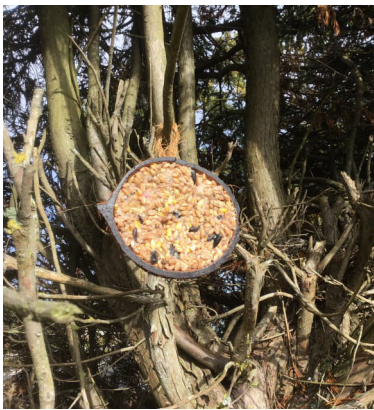
We then chose suitable sites to hang our feeders

We discussed how St Francis used his love for nature to show God as a mighty and loving creator. We then made bird feeders to show how we too can express a love for nature and a way of caring for our world.